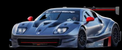
Ligier JS2 RS