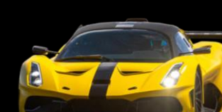
Brabham BT63 GT2