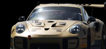
Porsche 911 GT2 RS