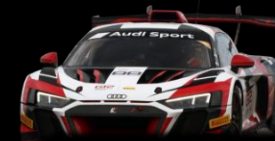
Audi R8 LMS GT2