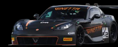
Ginetta G56 GT2