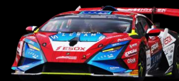
Lamborghini Huracan Super Trofeo EVO2

GT2 homologated and invitational cars compete for the same classification and follow the same Balance of Performance process .