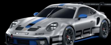
Porsche 992 & 911 GT3 Cup