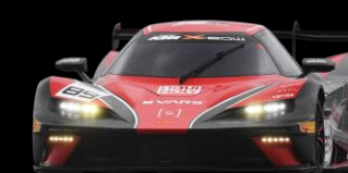
KTM X-BOW GT2